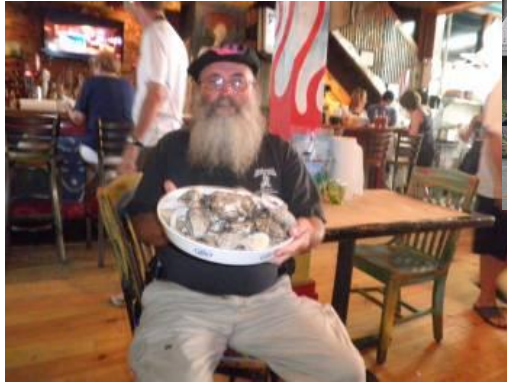
"A dozen oysters—lightly steamed—please"