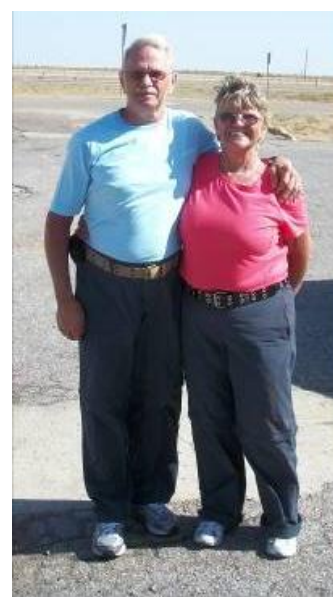
Guadalupe Desert, temperature 110 and no rain for over 2 years